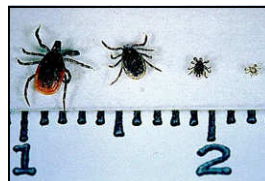
From left to right: deer tick adult female, male, nymph and larva on centimeter scale

Lyme disease is a serious disease transmitted by the deer tick. Always check yourself and your family for ticks after walking in the woods.